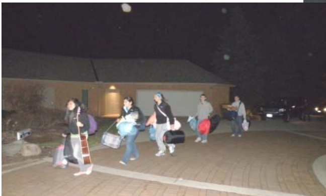
Spirit Day '09