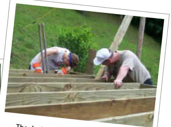
The deck/wheelchair ramp being built!

DROP-OFF WEEKEND before/after ALL the Masses NEXT WEEKEND.