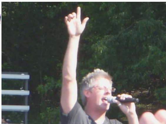
Recording artist Matt Maher performs on the Main Stage—other artists include Jeremy Camp.