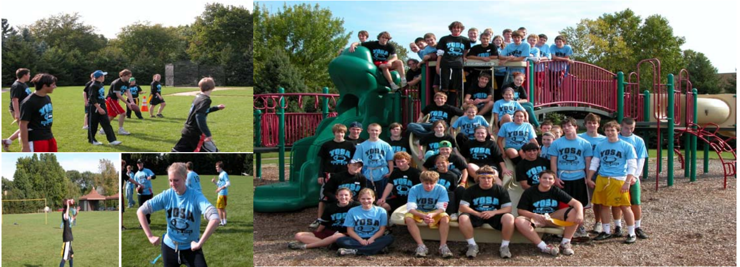
Our group picture from last year's Autumn Bowl

This is NOT listed on the PF/MF, so please make note of the location!