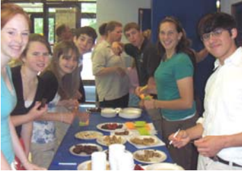
Again this year, we judged brownies and cookies at the Parish Picnic August 24th

involved from the Extraordinary Ministers and choir members to ushers, lectors, and gift-bearers. This makes it truly a "Youth Mass". Sign-up to participate in the next Youth Mass!