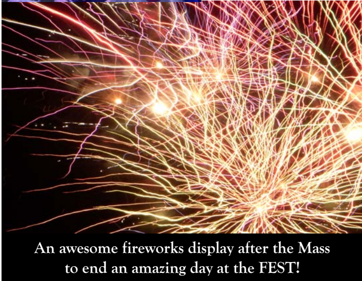
An awesome fireworks display after the Mass to end an amazing day at the FEST!