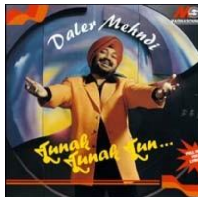
Had the video worked, this is the guy that you would have seen singing Tunak Tunak Tun. Yes, he has produced an actual album containing that song.